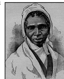
Sojourner Truth lived in Northampton MA in the 1840s.

Slavery's role in our history has a deep effect on us emotionally and psychologically, and this history continues to influence us all, every day, in ways both obvious and unconscious. Slavery has done immeasurable harm and, as whites, we know that the effects of it are our responsibility. Because of this, we are compelled to offer our apology to the descendents of all who were enslaved in the United States.